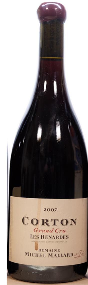
Undamaged wine stained by exterior source