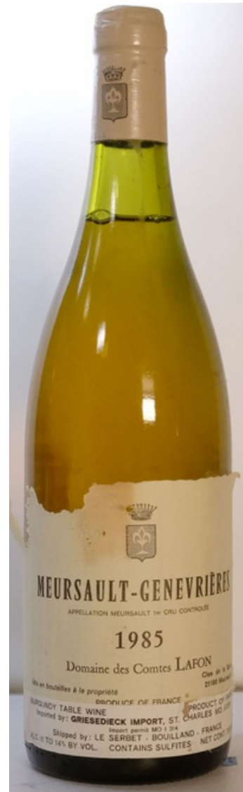
Low fill, torn and stained label, oxidized color