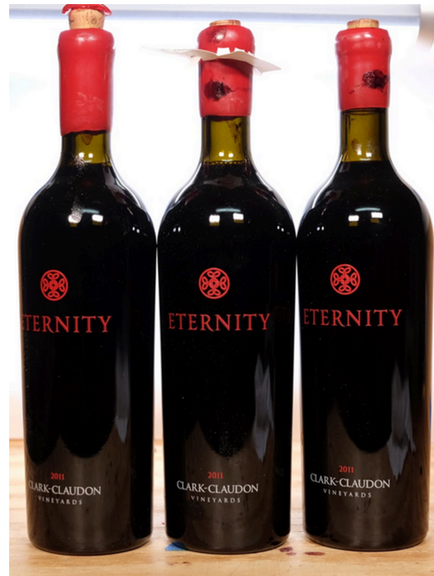
Protruding corks and signs of seepage