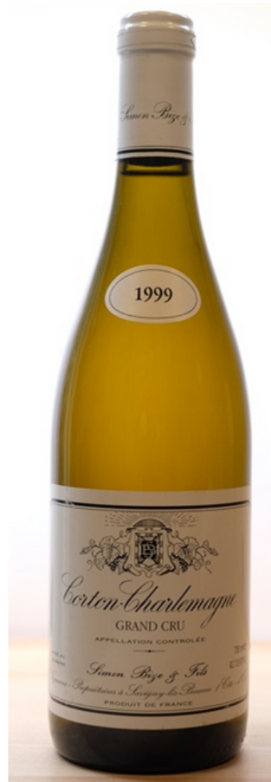
Mature white, age-appropriate condition